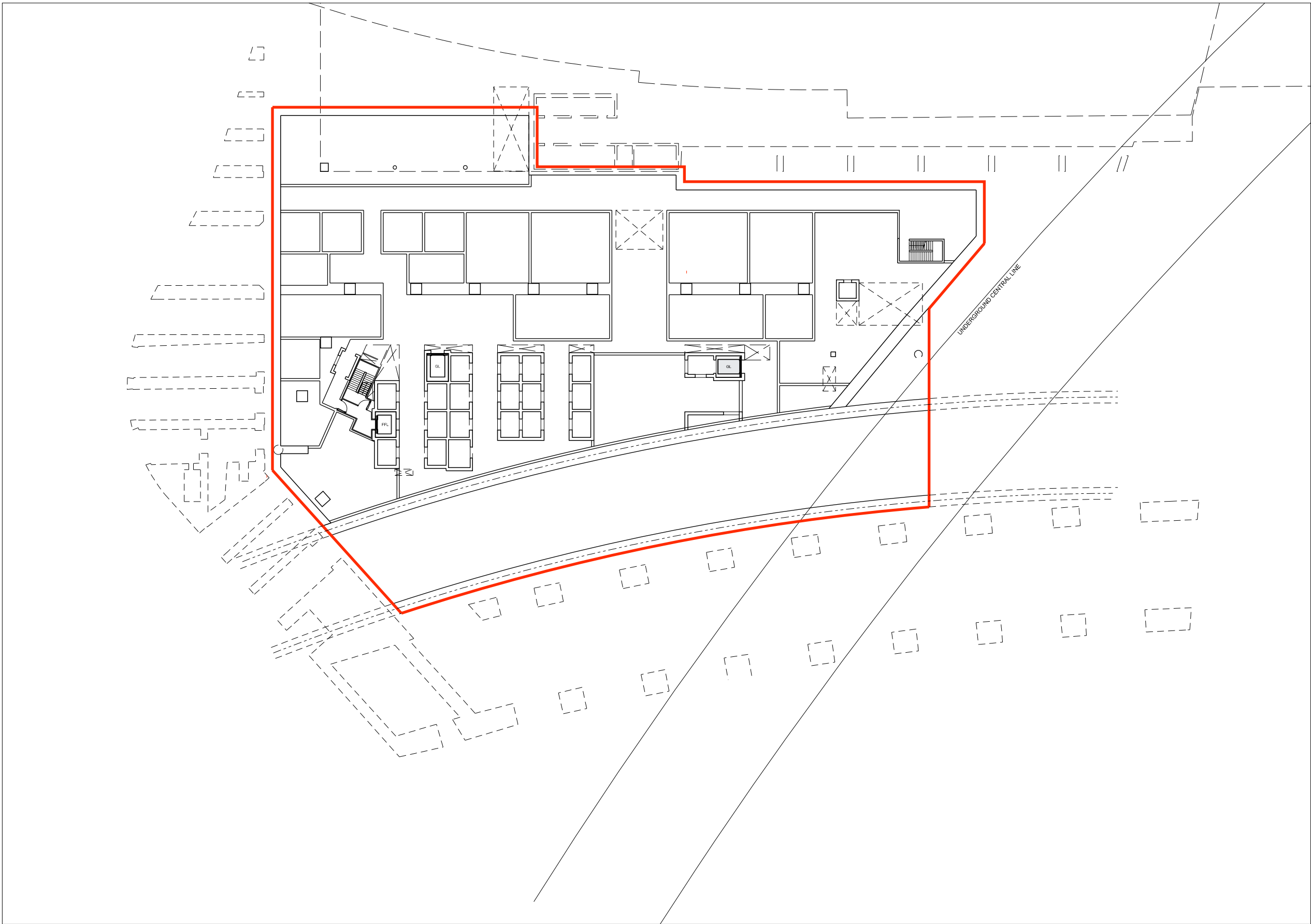
01 Basement 05-1-010 Proposed Plan 1:500 @A1