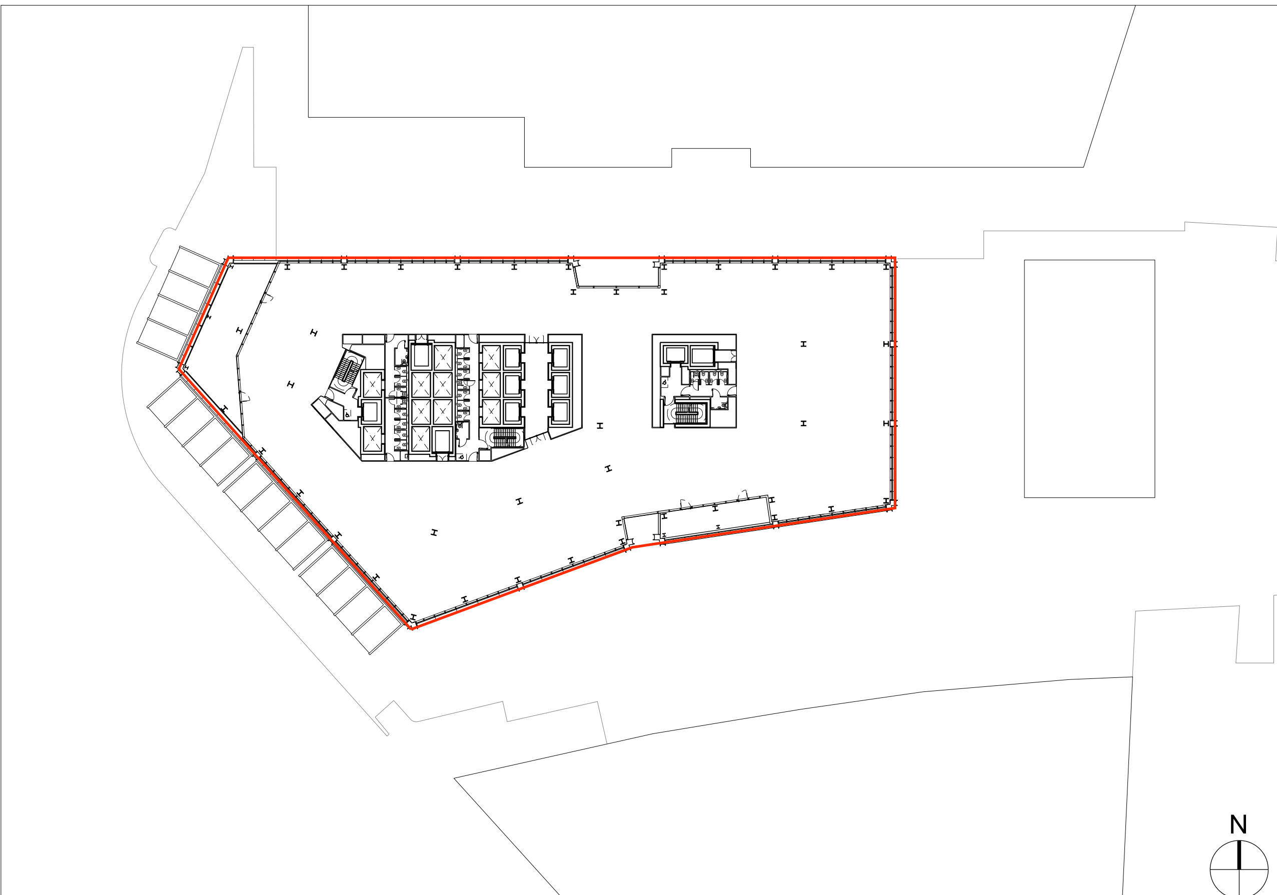
04 Typical Floor 05-1-010 Proposed Plan 1:500 @A1

This drawing is to be read in conjunction with all other contract documents and specifications and all other consultants drawings. All levels and dimensions should be checked on site and any discrepancies notified to the Architect prior to proceeding with works. THIS DRAWING IS COPYRIGHT. No drawing shall be reproduced in any form without prior written permission of Eric Parry Architects.